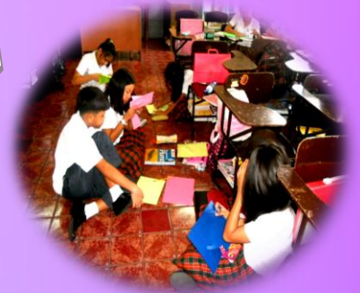
Homeroom Guidance Program

Individual Inventory gathers the necessary information from the pupils that would help the guidance counselor, teachers, and coordinators to understand them better. Obtained facts are used for pupils' evaluation.