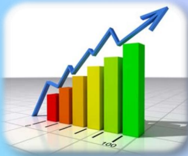
Research and Evaluation

Career Guidance - to assist the individual to become actively involved in a positive way in his career development and decision-making.